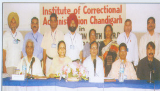
Valediction function for trainees at CDTs, Chandigarh

Prison Officials was organized by the Institute of Correctional Administration, Chandigarh from 26 th to 28 th May, 2008. Prison officials from the