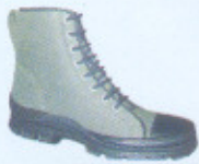
Derby Style(Jungle Boot) soles-PU single density