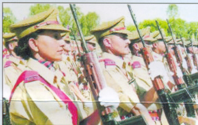
Trainees doing Police Drill

The translation of eight new chapters added to BPR&D Police Drill Manual is under progress and will be published and circulated to all concerned in the country.