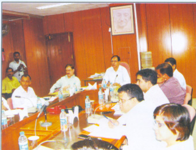
Scene from the Workshop on Crime Mapping Software at BPRD HQ.