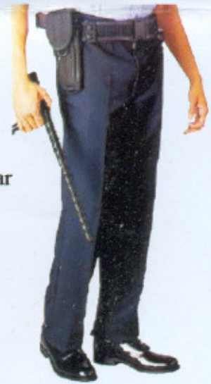
One of the new designs of the Pant