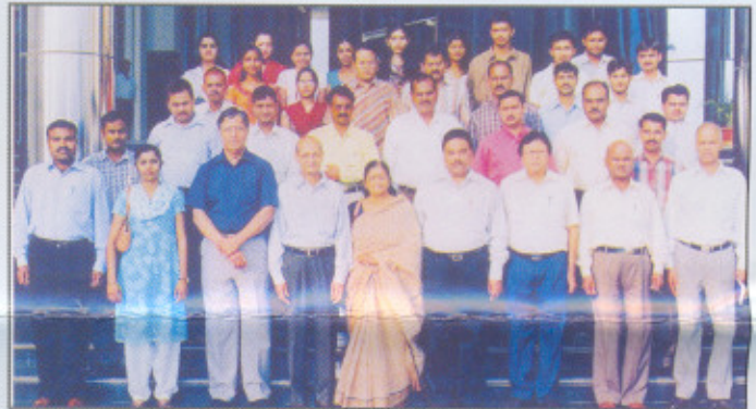
All India Training on Personality Development for Prison Officers