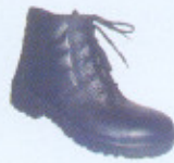
Ankle Boot soles-PU single/Double density