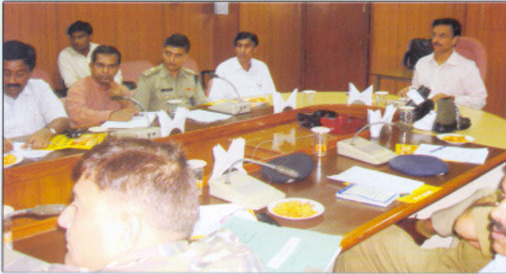
Meeting on Designing the new Police Footwear