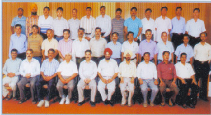
Crime Investigation Course at CDTs Chandigarh

Courses on "Advanced Scientific Methods of Crime Investigation(Level-1)" were organized at the Central Detective Training School, Chandigarh, Kolkata and Hyderabad to impart firsthand training to the Police Officers up to the rank of Sub-Inspector from the States. In all, 55 Police Officers from different State Police Forces participated in these Courses.