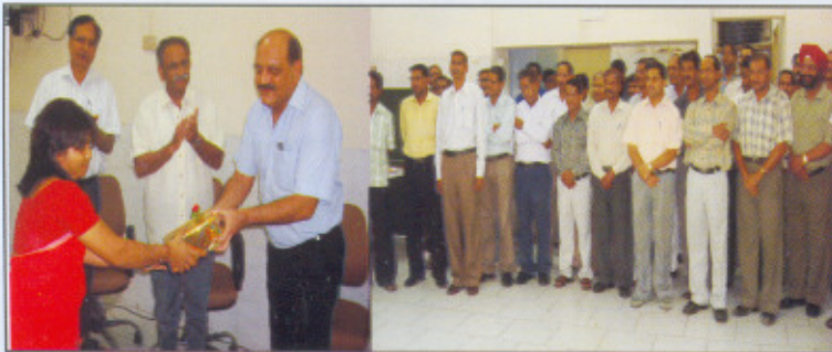
A farewell party held at BPR&D Headquarters