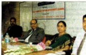
Participants at the summer training programme on Human Rights organized by RML National Law University on Thursday.

"Below violation human rights more than any other body or institution," he said. Police function also amounts to human rights violation. He said that State Human Rights Commission is doing the job in right manner. But it is provided with more powers, it can actually play a very effective role.