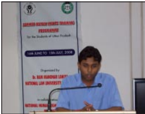
Participant Presenting his paper